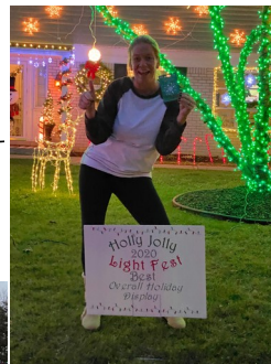
Best Overall Display: #2 The Sanderson's